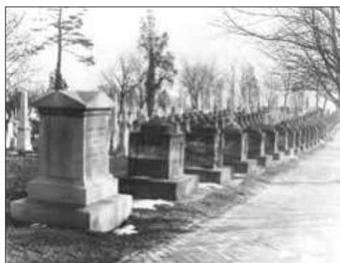
An early photo of Congressional Cemetery Washington, D.C