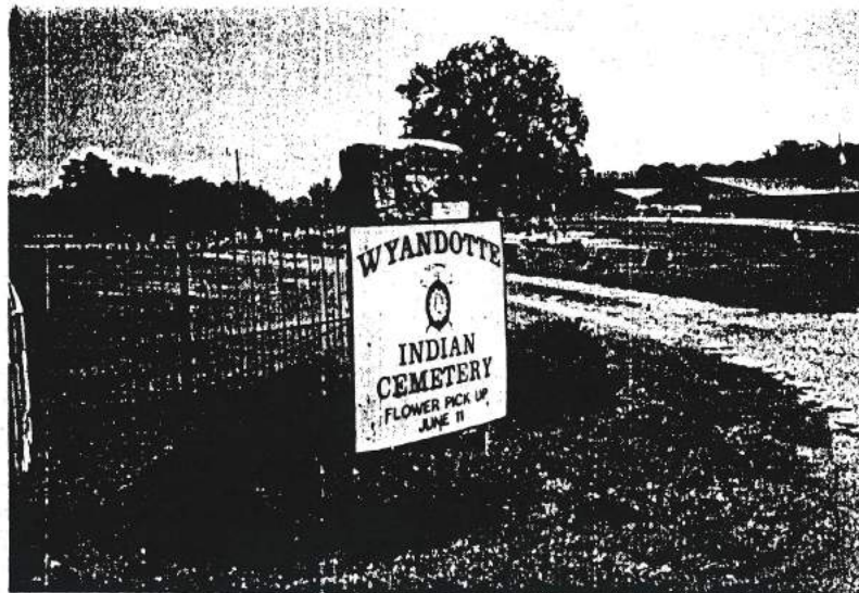
Entrance to the cemetery with tribal headquarters in the background

The Royal Dragon - Private Meeting Room 7837 East 51 st Street - Tulsa, Oklahoma Please bring a guest. We look forward to seeing you at both events!!