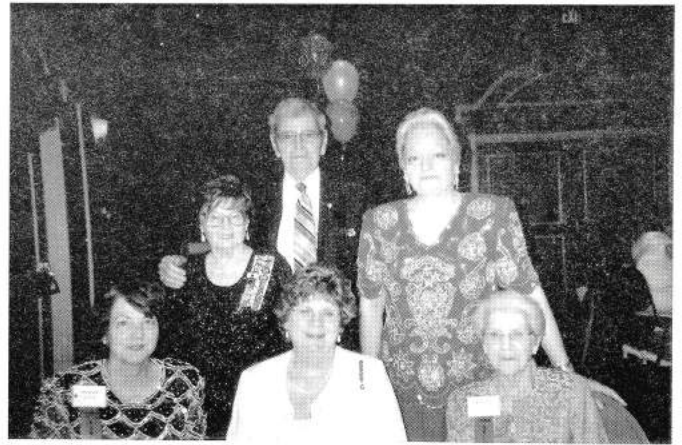
Texas DAR St Conference