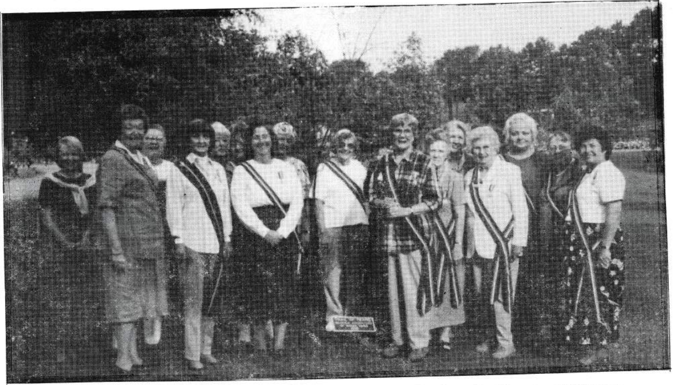
Council Attendees join the Georgia Daughters at the Dedication of a Weeping Willow to the Trail of Tears at the Etowah Indian Mounds.