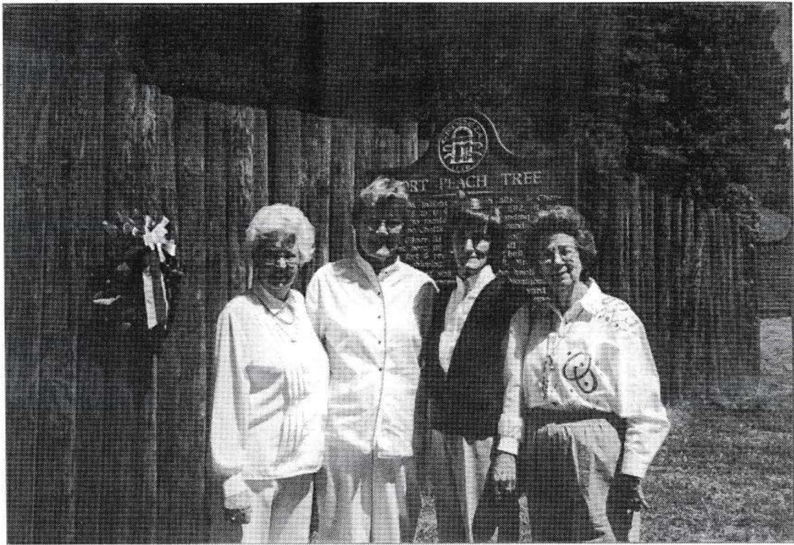
Annual Council Picnic at Fort Peach Tree on Saturday. 1. to r.