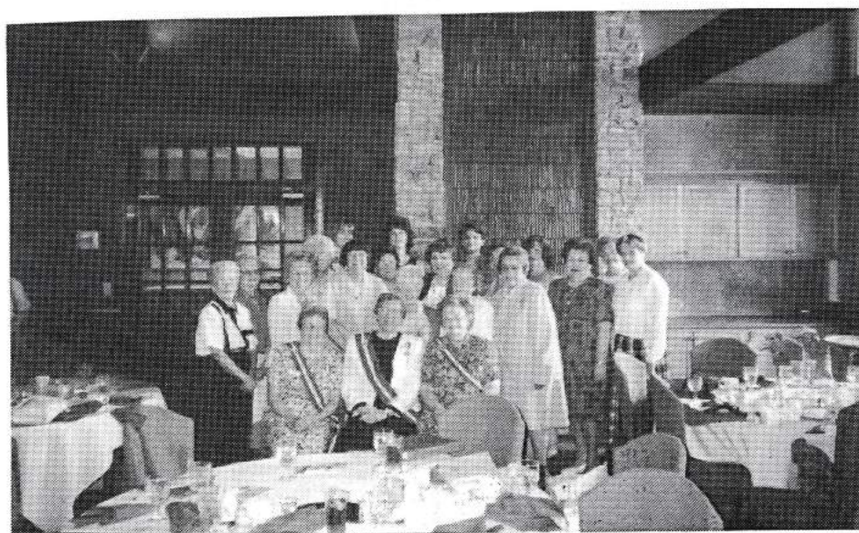
The Kansas State Society