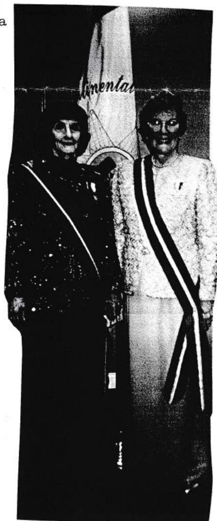
The Changing of the Guard