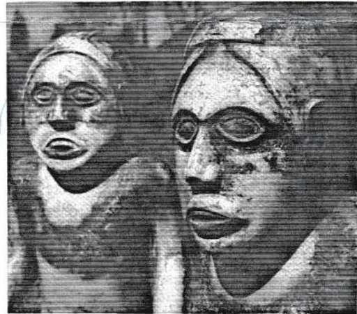
AN EXHIBIT at the Etowa Indian Mounds Museum

Please send any item of interest to your Governor General, e.g. a marriage of one of your members, perhaps a political